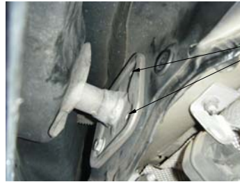
REMOVE BOLTS (2 PER SIDE)